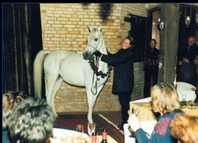
Middle left: "Love to play and have fun with Malakat El Nil (Muzannif DE x E-Vensong)."