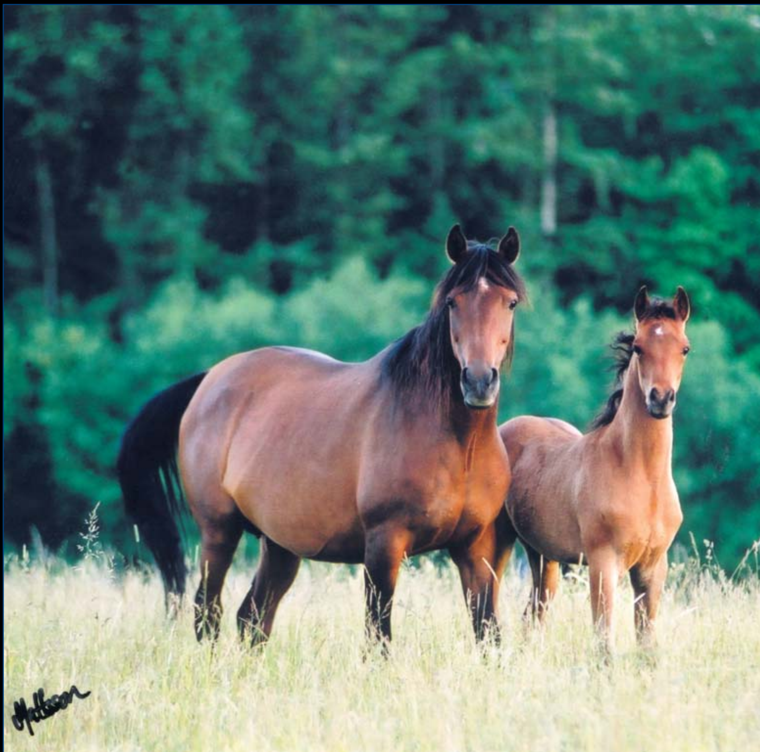
Top: Estetyka (Pierchur x Estancja) and her foal Elysion (by Alt [Pamir x Alejka]).