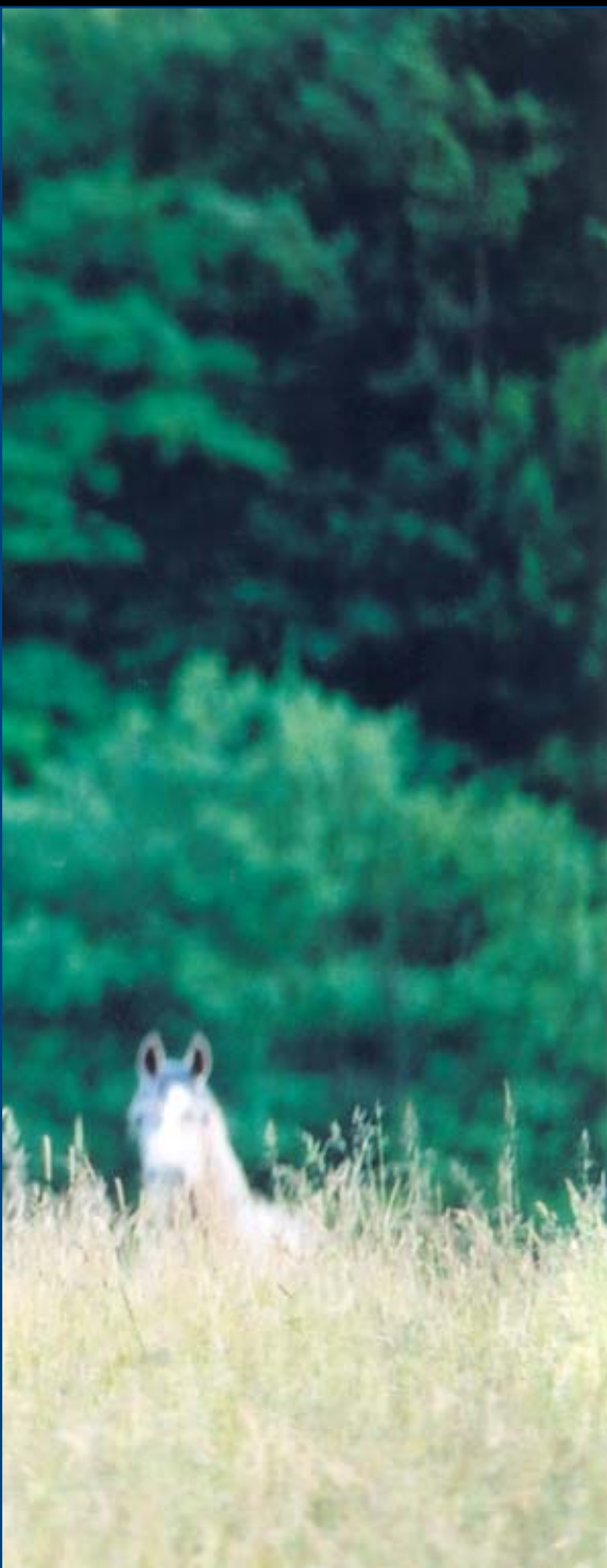
Right: The Kullatorp symbol in action.