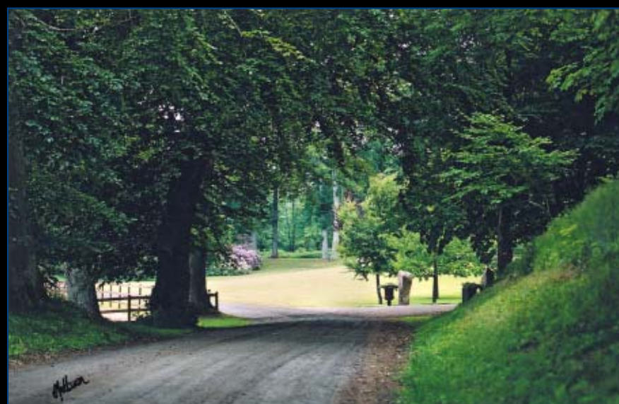
Bottom: A welcoming lane to Kullatorp.