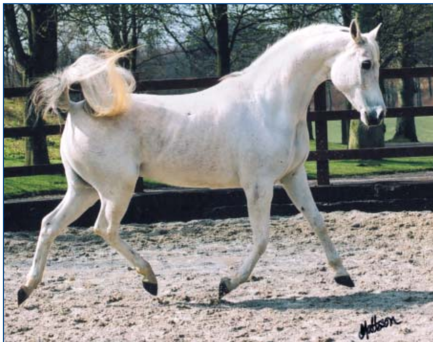
Emancypacja (Falsyfikat x Emigrantka).